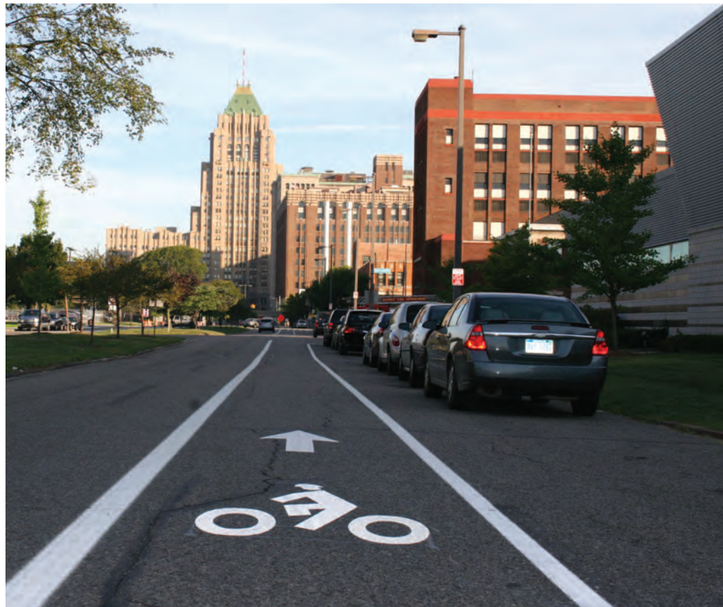
The Corktown-Mexicantown-Southwest Detroit Greenlink is part of the city’s Urban Non-motorized Transportation Master Plan. Linking Corktown, Mexicantown, and Southwest Detroit will provide people with convenient, safe access to three of the city’s most historic and vibrant neighborhoods.

Indeed, the majority of the improvements mentioned above were accomplished with pavement markings and signs. A small amount of road construction was required on each project to transition to adjacent sections of roadway, but very little in comparison to the entire project. The most significant costs were associated with the conversion of traffic signals to two-way operation. The point is, the improvements are not terribly expensive. The Southwest Detroit Greenlink cost $555,000 to construct, while the conversions of Second/Third Avenue cost $1,044,000. With municipal budgets shrinking, the ability to achieve so much for so little is important.